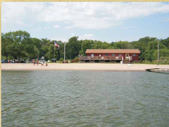
The Highwood Clubhouse and Beach

It's a little rustic... a bit cozy... and a lot of fun!